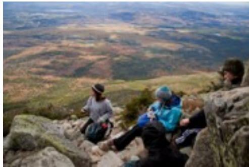
Mitchell Scholars stopped for lunch on their way up Kathadin, enjoying the amazing fall scenery.