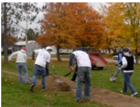
Mitchell Scholars worked hard to clean up three public areas in Bangor.