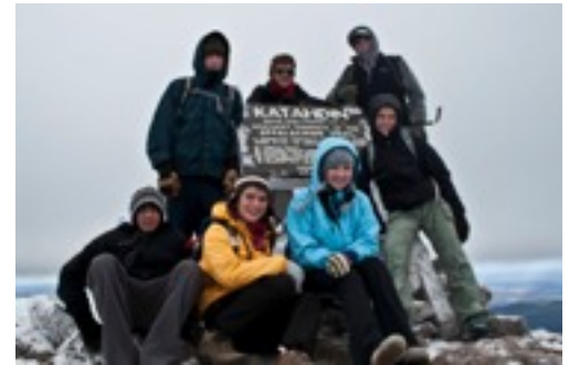
VICTORY! Mitchell Scholars summit Kathadin, finding snow and the best view in Maine!

The weekend is supported each year by a generous grant from Unum .